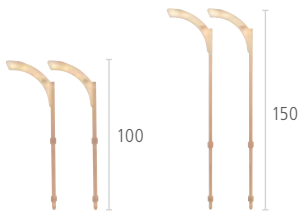
Low branch F811 £62

How can you incorporate fabrics if you cannot attach anything to the walls of your room? These 'Branches' connecting to shelving or panels with posts at least 61 cm tall, offer a solution.