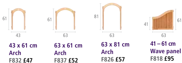
43 x 61 cm Arch F832 £47

These new panels and miniature arches were designed with the youngest children in mind.