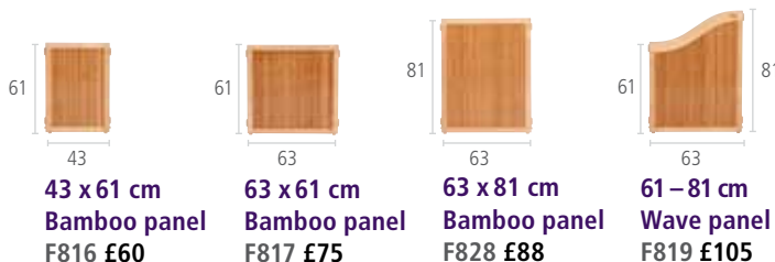
43 x 61 cm Bamboo panel F816 £60