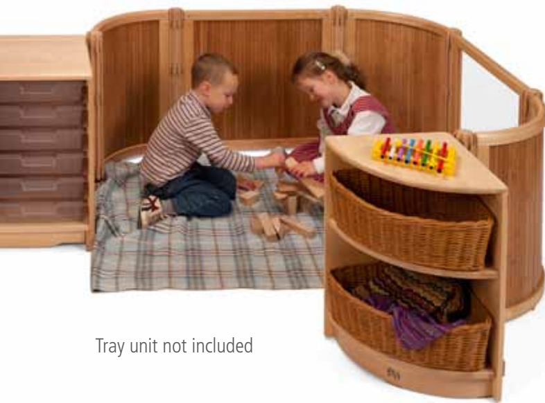
Tray unit not included