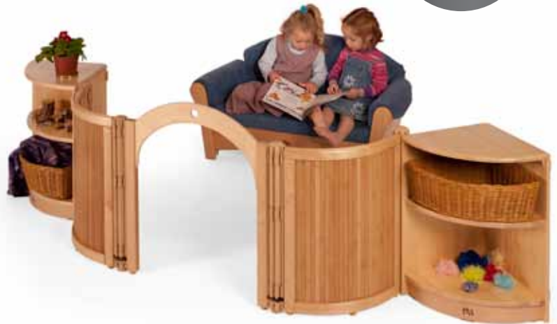
Sofa not included in set